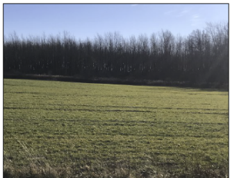
Two wheat fields show yellowing and leaf burn following herbicide application