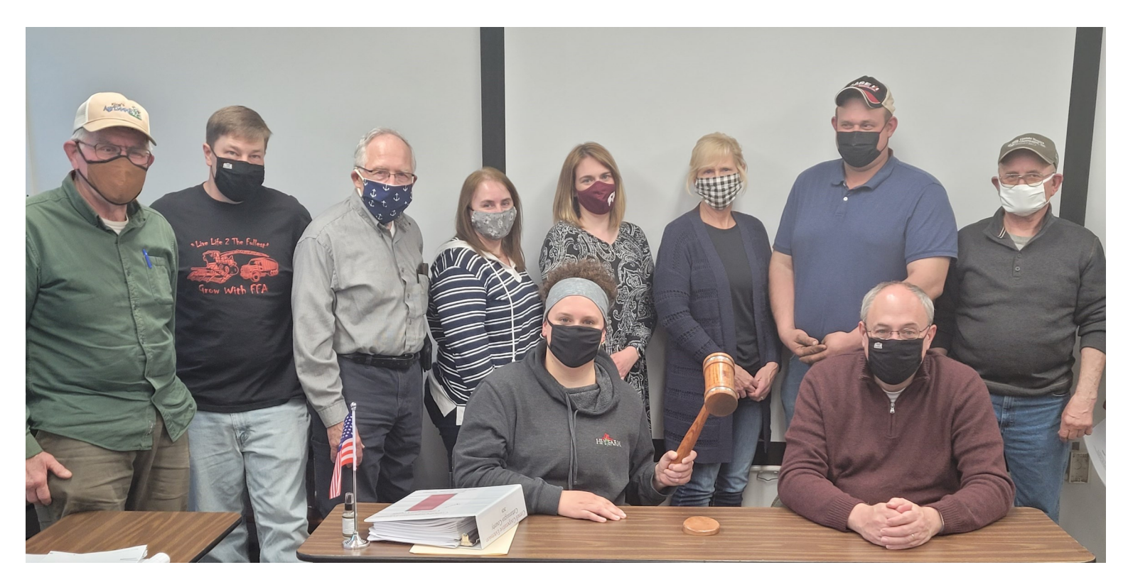
Thank you, for your dedication and service to the CCE of Cattaraugus County!