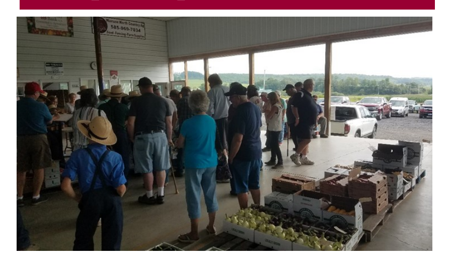
Photo: The Genesee Valley Produce Auction, an important market for regional vegetable growers.